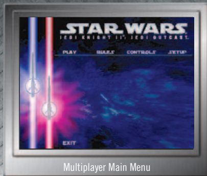
Multiplayer Main Menu

Click on the Multiplayer icon in the Launcher menu to take you to the Multiplayer menu. From customizing your multiplayer options to setting up and/or joining servers, this screen consists of everything you will need to enjoy multiplayer gameplay. NOTE: View the Readme on the game CD for last-minute manual updates and additional game information.