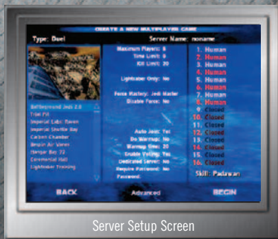
Server Setup Screen

If you'd like to start your own server, click the Create Server icon. From here, you'll be brought into a Setup screen where you can customize the game you're about to run. You can set the game type, maximum number of players, map, password, time limit, AI Bots, and more. In the Server Setup menu, you can open slots for Bots and set their overall difficulty level before starting the game. Just like having a lot of human